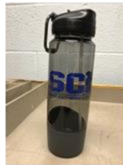
Water bottle - $13