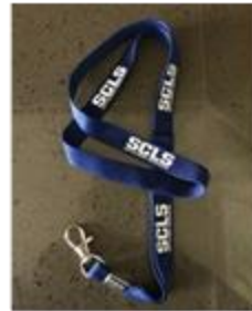
Lanyard - $5