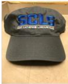
Baseball hat - $20