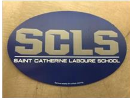
Magnet - $5