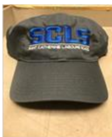
Baseball hat - $20