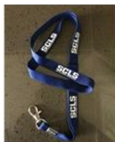
Lanyard - $5