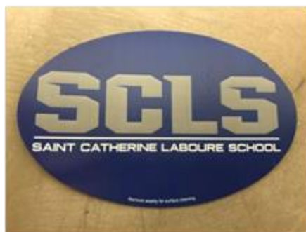
Magnet - $5