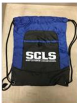
Cinch Sack - $10

To order, please fill out and clip the bottom of this flyer and send it into the school office with cash or check (made out to SCLS PTO). You can also pay via Venmo - @sclspto. Quantities are limited - first come, first served!