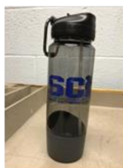
Water bottle - $13