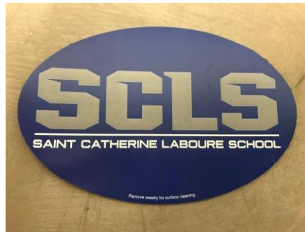
Magnet - $5