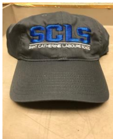
Baseball hat - $20