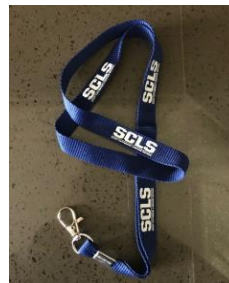
Lanyard - $5