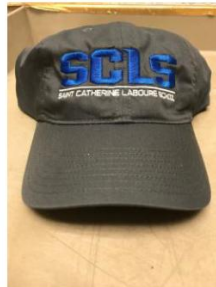
Baseball hat - $20