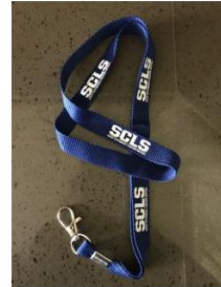
Lanyard - $5