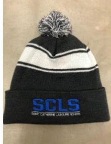
Beanie hat - $15