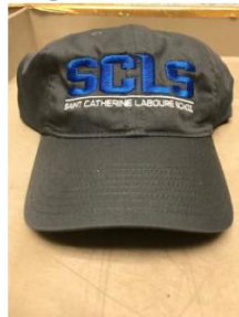
Baseball hat - $20