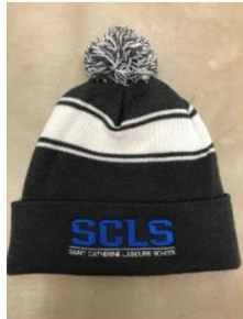
Beanie hat - $15