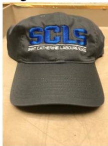
Baseball hat - $20