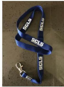
Lanyard - $5