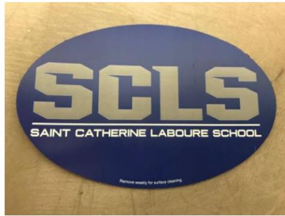
Magnet - $5