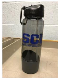
Water bottle - $13