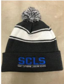
Beanie hat - $15