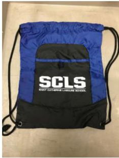
Cinch Sack - $10

To order, please fill out and clip the bottom of this flyer and send it into the school office with cash or check (made out to SCLS PTO). You can also pay via Venmo - @sclspto. Quantities are limited - first come, first served!