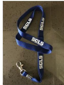
Lanyard - $5