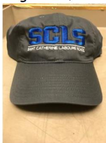
Baseball hat - $20