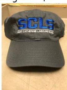
Baseball hat - $20