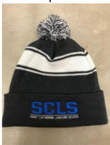
Beanie hat - $15