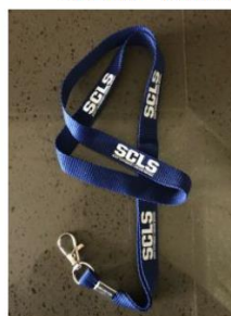
Lanyard - $5