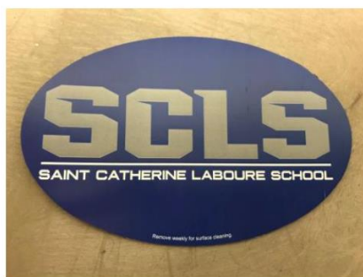
Magnet - $5