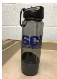
Water bottle - $13