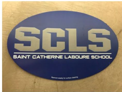
Magnet - $5