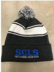
Beanie hat - $15