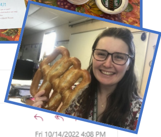
Fri 10/14/2022 4:08 PM