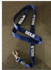
Lanyard - $5