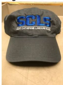
Baseball hat - $20