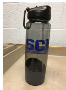
Water bottle - $13