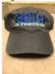
Baseball hat - $20