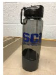
Water bottle - $13