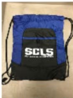
Cinch Sack - $10

To order, please fill out and clip the bottom of this flyer and send it into the school office with cash or check (made out to SCLS PTO). You can also pay via Venmo - @sclsppt. Quantities are limited - first come, first served!