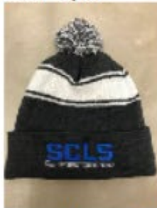
Beanie hat - $15