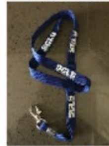
Lanyard - $5