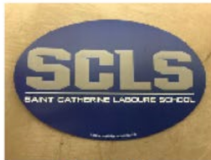
Magnet - $5