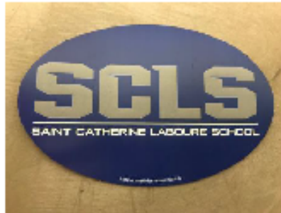
Magnet - $5