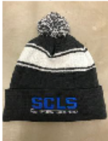
Beanie hat - $15