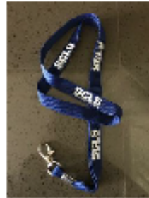
Lanyard - $5