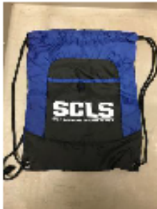
Cinch Sack - $10

To order, please fill out and clip the bottom of this flyer and send it into the school office with cash or check (made out to SCLS PTO). You can also pay via Venmo - @sclspto. Quantities are limited - first come, first served!