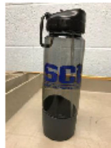
Water bottle - $13