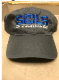
Baseball hat - $20