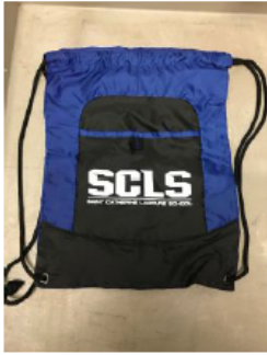
Cinch Sack - $10

To order, please fill out and clip the bottom of this flyer and send it into the school office with cash or check (made out to SCLS PTO). Quantities are limited - first come, first served.