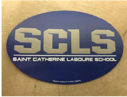
Magnet - $5