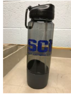
Water bottle - $13