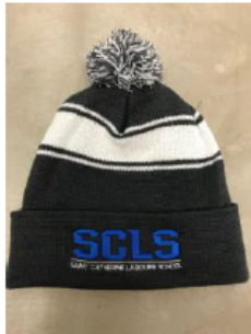
Beanie hat - $15