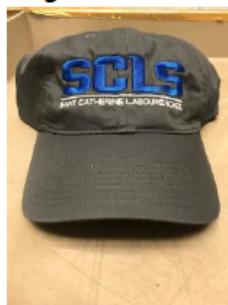
Baseball hat - $20