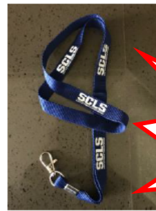
Lanyard - $5