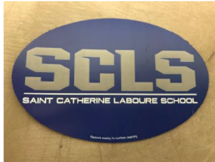
Magnet - $5