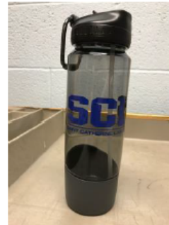
Water bottle - $13