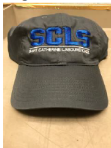
Baseball hat - $20