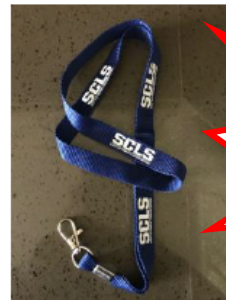
Lanyard - $5