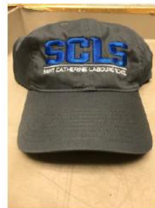
Baseball hat - $20