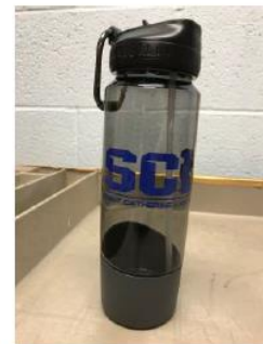
Water bottle - $13