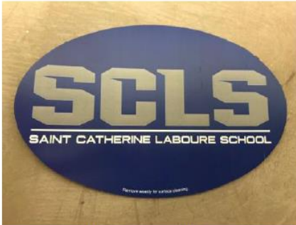
Magnet - $5