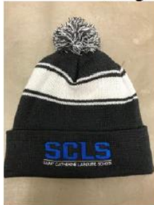
Beanie hat - $15